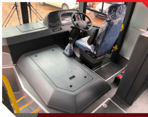
Modern G.R.P dashboard, with sound & heat insulation built-in

STEERING - Hydraulic power assisted steering