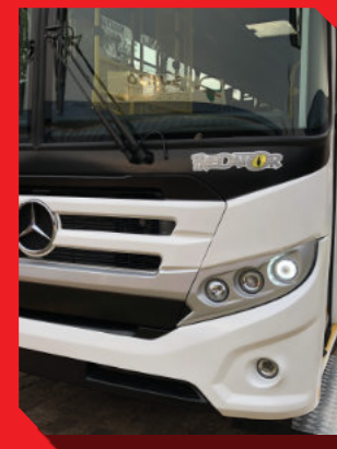
Individual headlights with LED daytime running lights