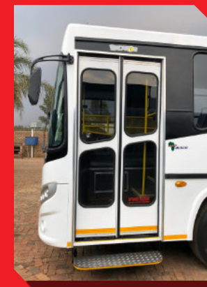
Easy access for Passengers to saloon area