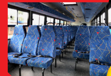
Various seats trimmed in vinyl / cloth