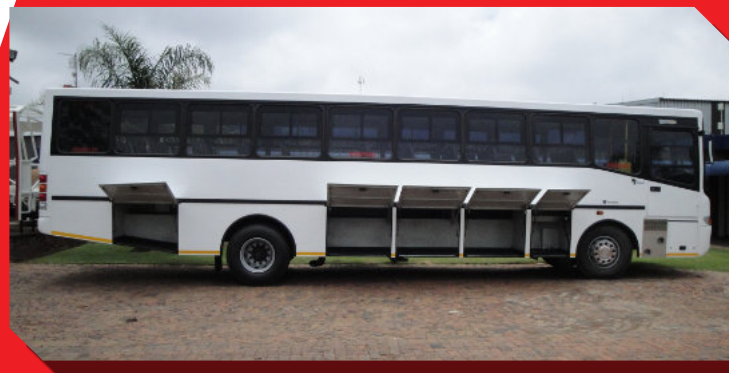
Maximum luggage lockers with locker Space across the chassis - Max capacity of approximately 5m³