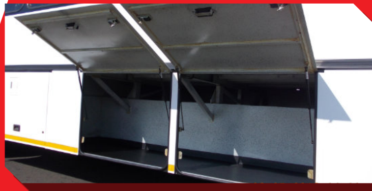
Maximum luggage lockers with locker Space across the chassis - Max capacity of approximately 5m³