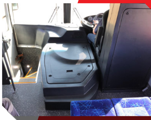
Modern G.R.P dashboard, with sound & heat insulation built-in