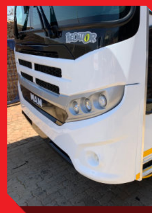
Individual headlights with LED daytime running lights