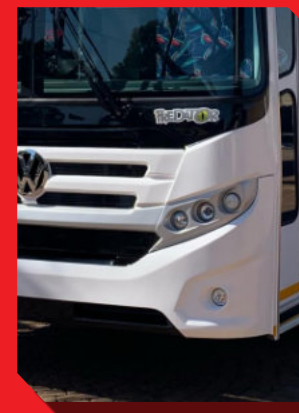
Individual headlights with LED daytime running lights