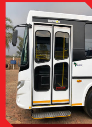
Easy access for Passengers to saloon area