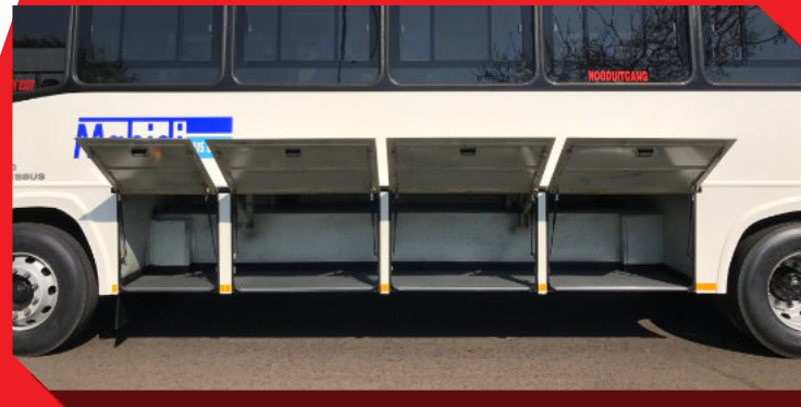
Maximum luggage lockers with locker Space across the chassis - Max capacity of approximately 5m³