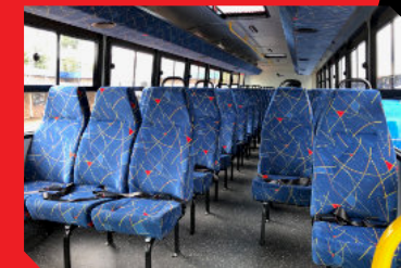
Various seats trimmed in vinyl / cloth