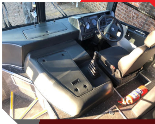
Modern G.R.P dashboard, with sound & heat insulation built-in